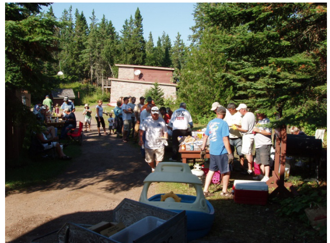
IRBA Members enjoying the Saturday Fish Fry.

The Fish Fry was a huge success this year as we had about 160 people attend the feast. IRBA appreciates all those who participated in the fishing event and helped with the fish fry.