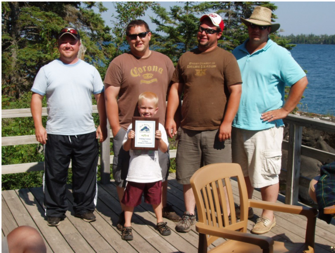
The Sea Su Crew