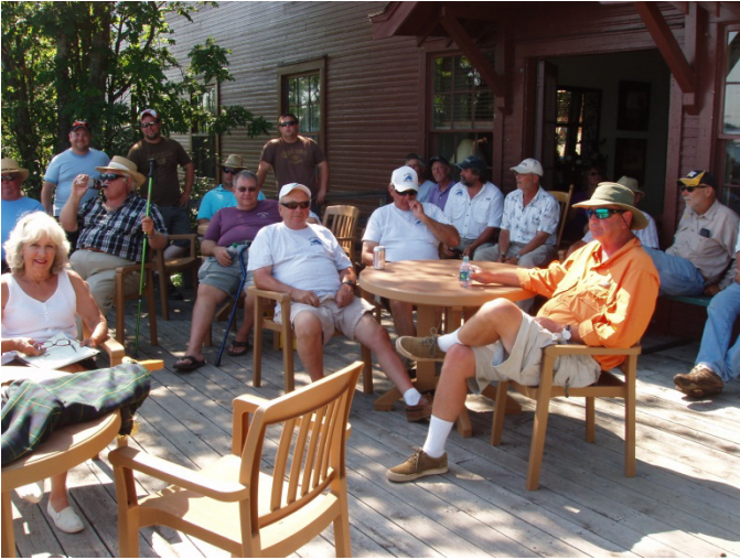
More happy IRBA Members.