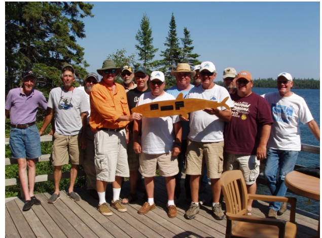
The Minnesota Fishermen.

The coveted Wooden Herring Award went to the Minnesota Fishermen with a total weight of 69 lbs. 8 oz. Congratulations to the Minnesota Fishermen as they have extended their lead in the number of Wooden Herring Awards. The 2013 tournament to be held at Windigo Harbor will be exciting. The rules for the fish tournament will continue to be the same.